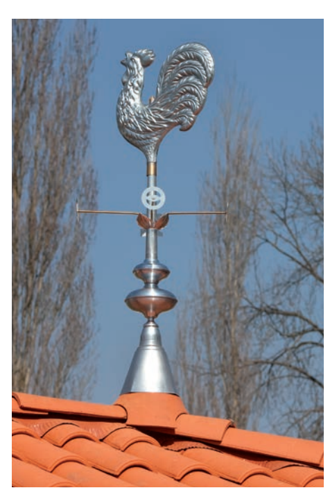
Theather, Quimper (France)