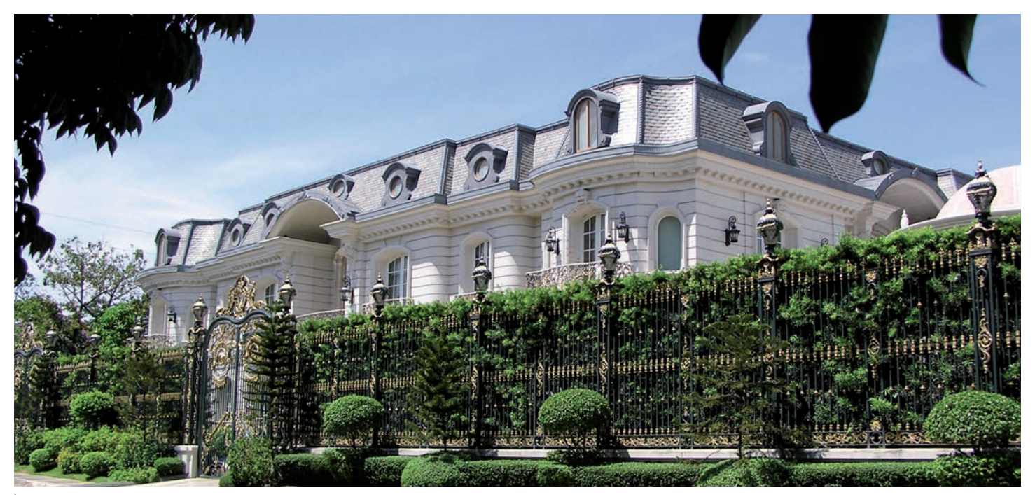
Manilla Villa (Philippines)